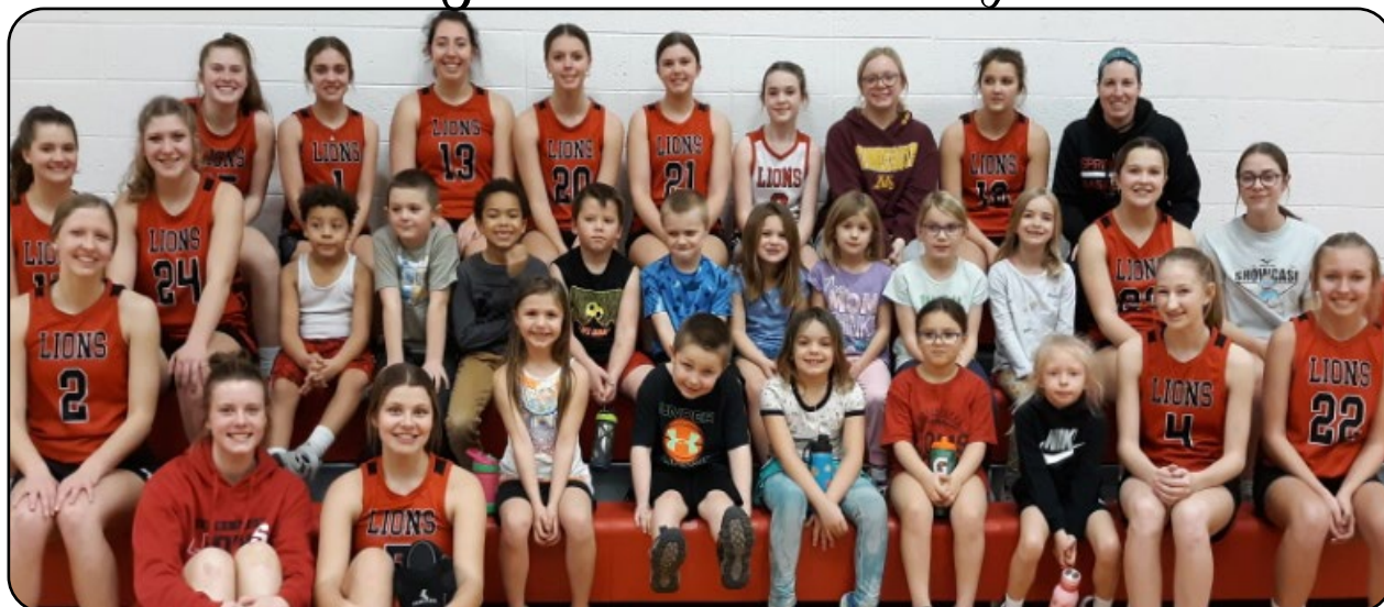
First & Second Graders pictured with the girls JV & Varsity basketball players